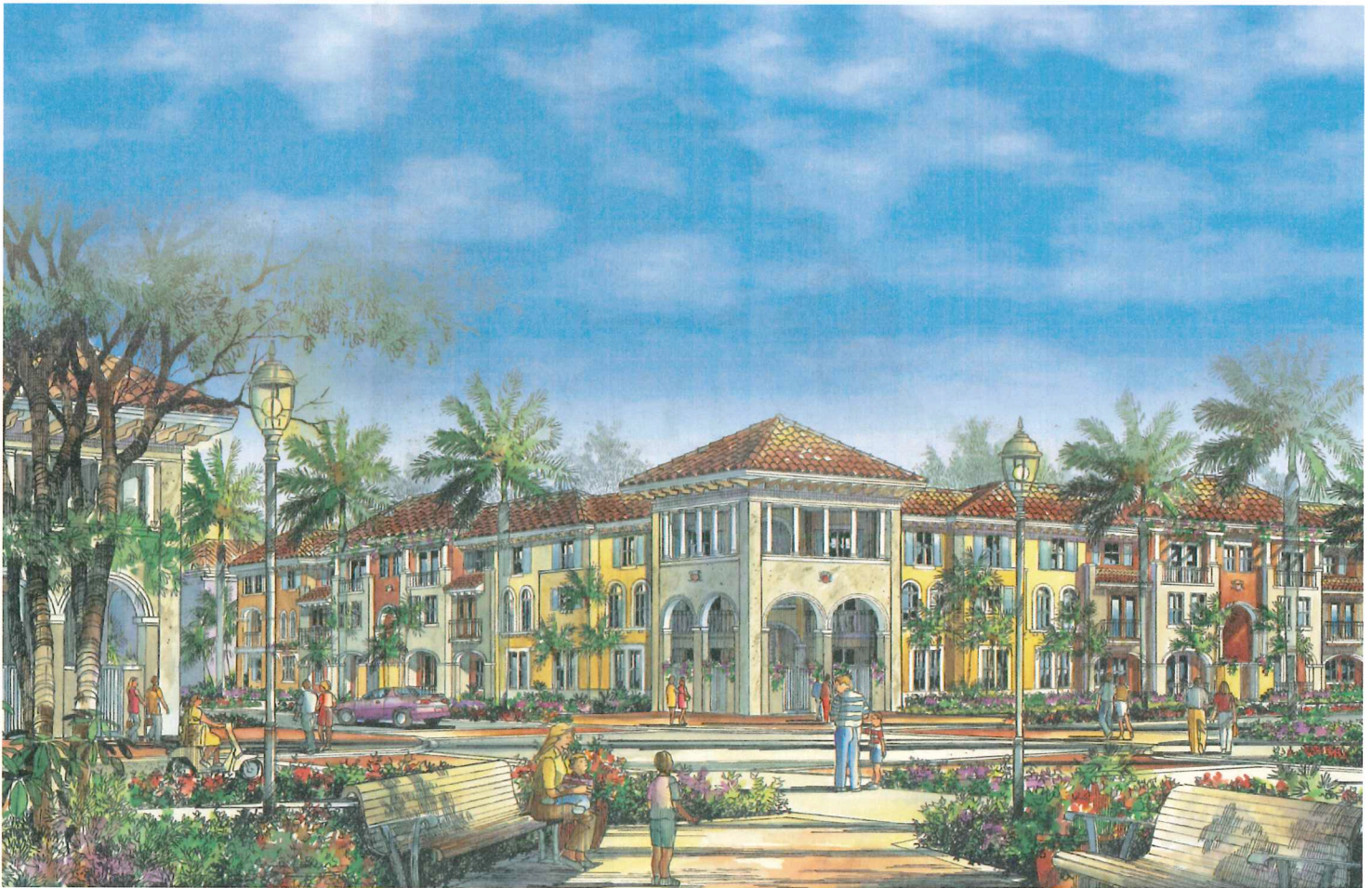
Preliminary Artist's Concept

1-Story | 3 Bedrooms | 2.5 Baths | Family Room | Covered Terrace